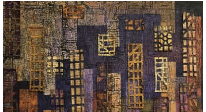
January 13 – April 27