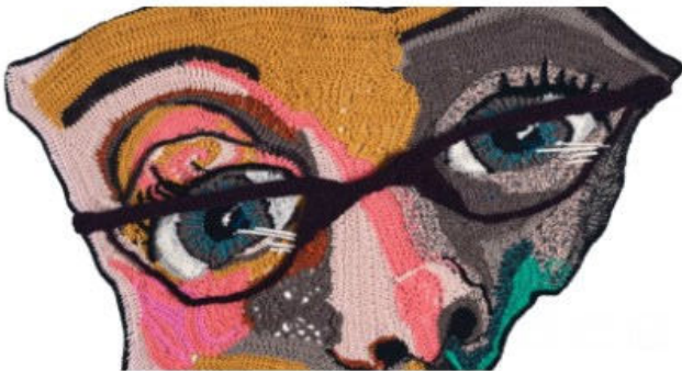
January 13 – March 2