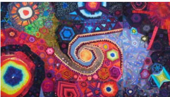
January 13 – April 27