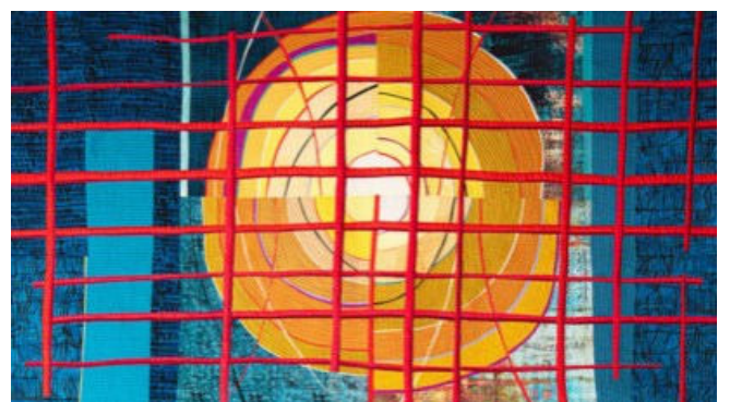
January 13 – April 27

Visions Museum of Textile Art | 2825 Dewey Road, Suite 100 | San Diego, CA 92106